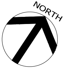
EXHIBIT "B" INGRESS & EGRESS EASEMENT OVER ADJUSTED TAX PARCEL 02070111-7000 LOCATED IN THE NE 1/4 OF THE NE 1/4 OF SECTION 1, T2N, R7 E, W.M. SKAMANIA COUNTY, WASHINGTON