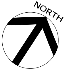
EXHIBIT "B" ADJUSTED TAX PARCEL 02070111-6800 LOCATED IN THE NE 1/4 OF THE NE 1/4 OF SECTION 1, T2N, R7 E, W.M. SKAMANIA COUNTY, WASHINGTON CASCADE STREET