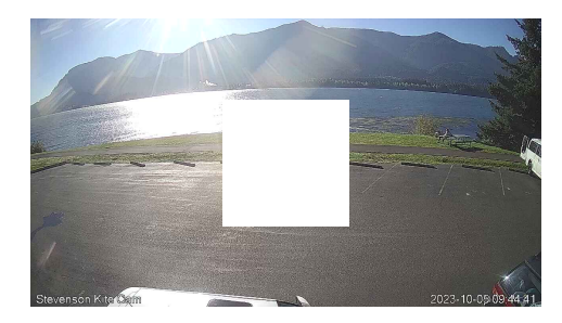
Live Kite Cam