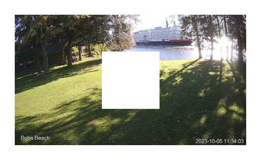
Live Bob's Beach Cam