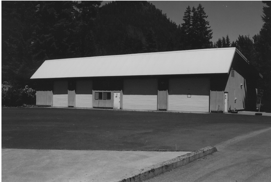
SOUTH-FACING ELEVATION OF STORAGE BUILDING 2624

Physical Description: This 4,700 square foot building was built in 1976. It is located on Parcel 2, behind the Seed Processing Building (2130). The building has four roll-up doors and one insulated electrical room with a loft above. Natural ventilation is provided near ceiling. Major systems in the facility include three-phase power, single-phase power, and water. Accommodations are needed for restroom facilities in this building.