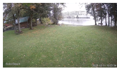
Live Bob's Beach Cam